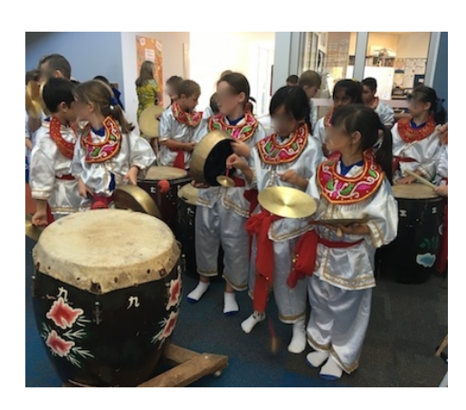
Lion dance drum and percussion workshops